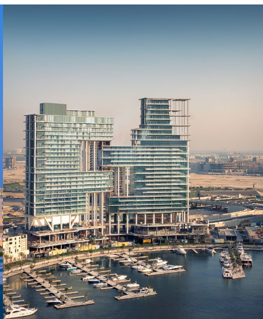
THE RESIDENCES, DORCHESTER COLLECTION, DUBAI