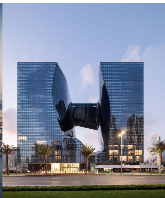
THE OPUS BY OMNIYAT, DESIGNED BY ZAHA HADID